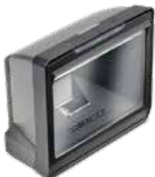
Image capture 1D bar code reading performance for medium- to high-volume retailers such as drug, grocery, specialty soft goods, hard goods and department stores, the X-POS LX 8000 offers a cost-effective, hands-free solution. It is designed for maximum uptime to withstand the toughest and busiest retail environments.